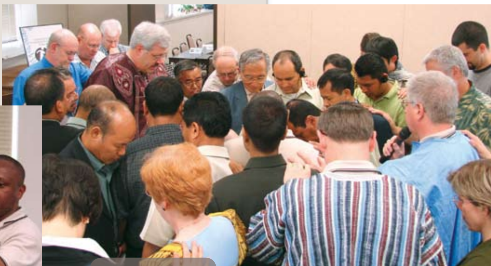
We spent a lot of time in prayer for each other.