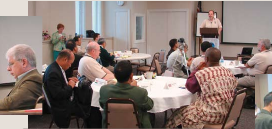
Time spent in discussion of issues that affect our international churches both internally and externally.